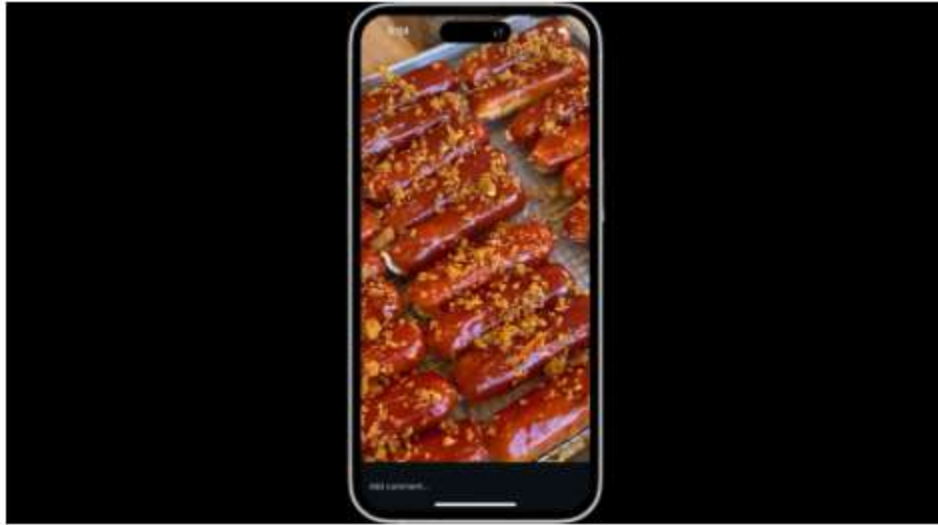
A close-up of the guava and cheese fan-fans at Fan-Fan Doughnuts.

During Hanukkah, Gerson sells delicious and inventive sufganiyot, which are traditionally fried, round jelly-filled doughnuts that are enjoyed during the holiday. But the pastry that made the Times' list can be enjoyed year-round: an éclair-inspired doughnut, known as a fan-fan, that's filled with cream cheese, glazed with guava and topped by a brown butter walnut cookie crumble.