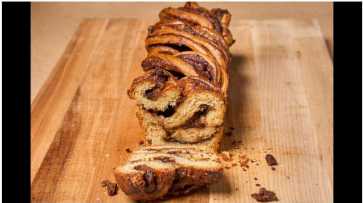
Breads Bakery's chocolate babka is one of NYC's 25 'essential pastries' according to T: The New York Times Magazine.

Inspired by the “ bakery renaissance ” that’s currently underway across New York City — if you spot a line somewhere, there’s a very good chance there are baked goods at the end of it — T: The New York Times Style Magazine has assembled a list of “ The 25 Essential Pastries to Eat in New York City .”