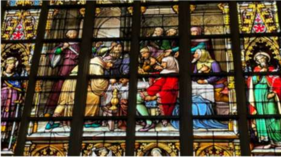
A stained-glass window at the Cathedral of Saints Michael and Gudula in Brussels depicts Jews desecrating the host used during the Eucharist in the Catholic Mass. The accusations led to the execution of some Jews and the expulsion of others in 1370.

The new plaques cite Nostra Aetate and the Catholic Church's subsequent effort under Pope John Paul II to reckon with historical antisemitism in 2000. They affirm the church's "commitment to combat all forms of antisemitism, to deepen dialogue between Jews and Christians, and to pass on to future generations a clear remembrance, based on the acknowledgement of truth and mutual respect."