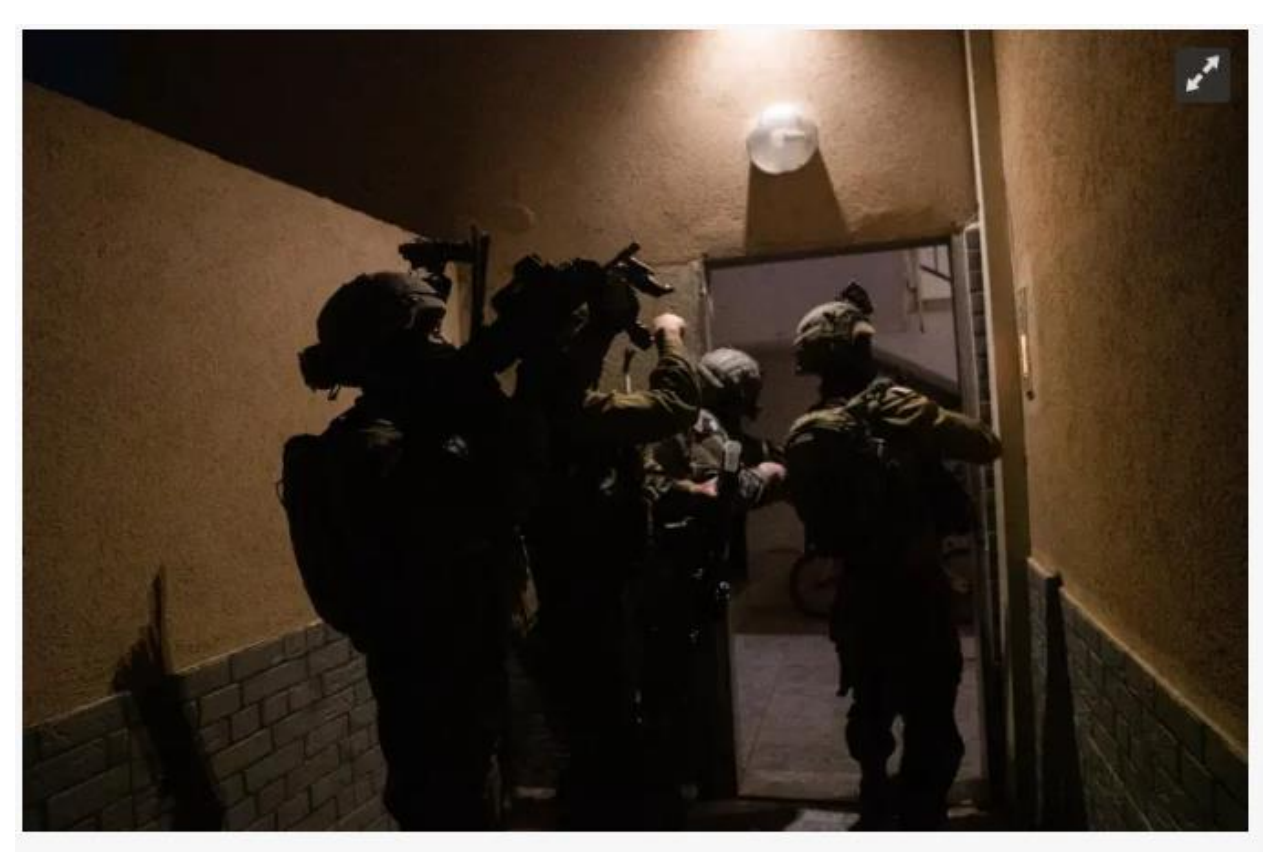
IDF troops operating in Nablus, the West Bank, against terrorists who murdered the Dee sisters and mother, on May 4, 2023